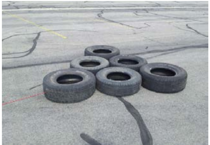
A towed target crafted out of used tires provides a cost-effective solution to range operators.

Step 1: Identify and procure six (6) used tires. These tires can be well-worn and no longer street