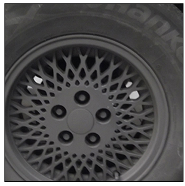
The windows (left) are tinted with matte black vinyl and wheels (right) are sprayed with a flat black finish to minimize reflective light.

hrough our field experience we have learned from our customers about the need for laser safe operations. We have produced some simple and effective ways that will help minimize reflective laser light. During aircrew training exercises, a combat laser is used to direct ordinance, designate targets, measure distances, etc. These laser designators fire coded pulses of laser light at a target, which is then reflected from the target's surface. The reflected