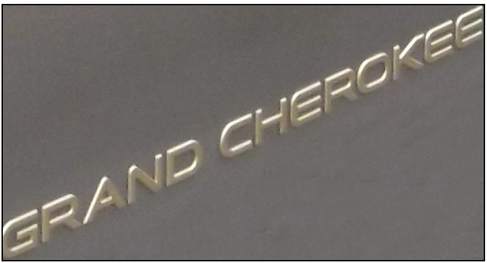
The emblems should be removed from the vehicle to minimize reflective laser light that could cause eye damage.

While the requirement for laser eye protection for anyone in close proximity to the target is not eliminated, the risks to unsuspecting personnel is reduced.