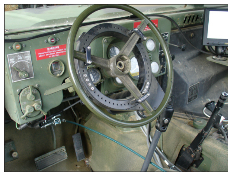
A Pronto4™ Strap-on Autonomy System Series 2 installed on a miltary HMMWV.